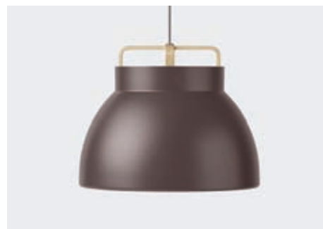
BROWN / NATURAL OAK HANGER

LAMP — Spindled Aluminium / White inside HANGER / CORD — Form-pressed Oak Veneer / Grey Cord