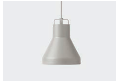
GREY / GREY HANGER

— Item No. 80201 LAMP — Spindled Aluminium / White inside HANGER / CORD — White Steel hanger / White Cord