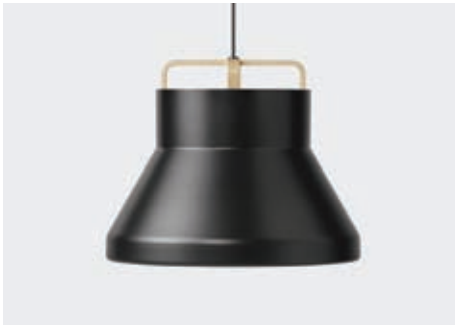
BLACK / NATURAL OAK HANGER

— Item No. 80210 LAMP — Spindled Aluminium / White inside HANGER / CORD — Form-pressed Oak Veneer / Black Cord