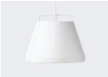
WHITE / WHITE OAK HANGER

— Item No. 80111 LAMP — Spindled Aluminium / White inside HANGER / CORD — Form-pressed Oak Veneer / White Cord