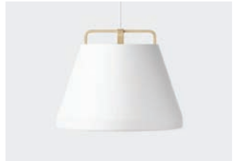
WHITE / NATURAL OAK HANGER

— Item No. 80117 LAMP — Spindled Aluminium / White inside HANGER / CORD — Form-pressed Oak Veneer, Black Lacquer / Black Cord