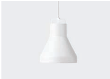
WHITE / WHITE HANGER

— Item No. 80200 LAMP — Spindled Aluminium / White inside HANGER / CORD — Black Steel hanger / Black Cord