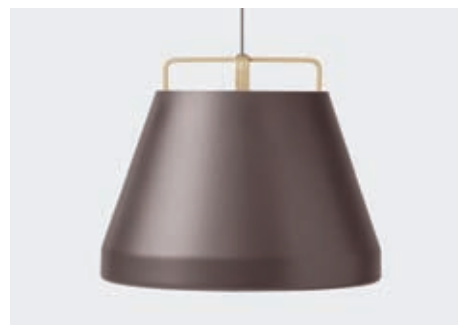
BROWN / NATURAL OAK HANGER

— Item No. 80125 LAMP — Spindled Aluminium / White inside HANGER / CORD — Form-pressed Oak Veneer / Grey Cord