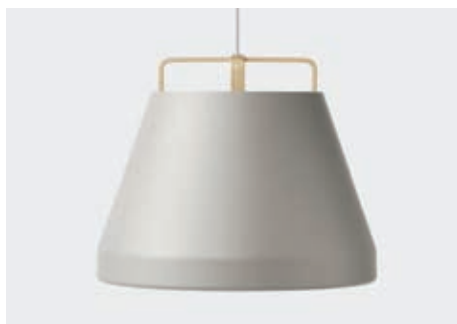
GREY / NATURAL OAK HANGER

— Item No. 80128 LAMP — Spindled Aluminium / White inside HANGER / CORD — Form-pressed Oak Veneer, White Lacquer / White Cord