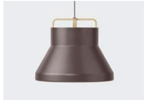
BROWN / NATURAL OAK HANGER

— Item No. 80215 LAMP — Spindled Aluminium / White inside HANGER / CORD — Form-pressed Oak Veneer / Grey Cord