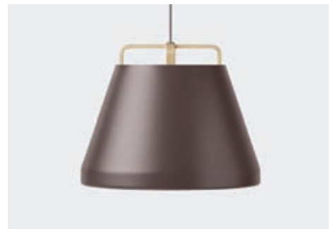
BROWN / NATURAL OAK HANGER

— Item No. 80115 LAMP — Spindled Aluminium / White inside HANGER / CORD — Form-pressed Oak Veneer / Grey Cord