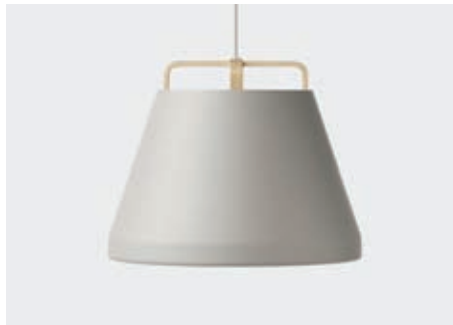
GREY / NATURAL OAK HANGER

— Item No. 80118 LAMP — Spindled Aluminium / White inside HANGER / CORD — Form-pressed Oak Veneer, White Lacquer / White Cord