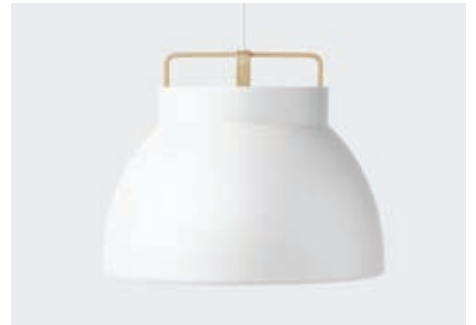
WHITE / NATURAL OAK HANGER

Item No. 80327 LAMP — Spindled Aluminium / White inside HANGER / CORD — Form-pressed Oak Veneer, Black Lacquer / Black Cord