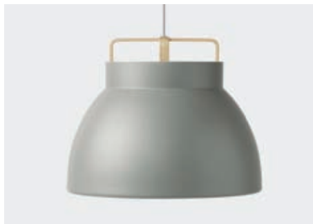
DUSTY GREEN / NATURAL OAK HANGER

Item No. 80324 LAMP — Spindled Aluminium / White inside HANGER / CORD — Form-pressed Oak Veneer / Grey Cord