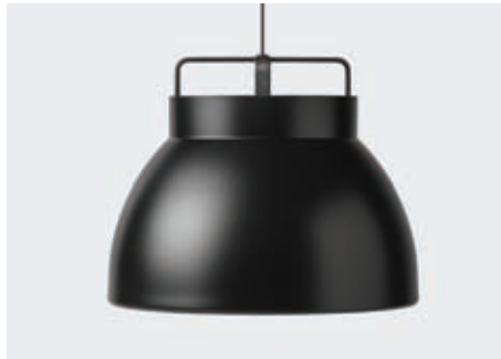
BLACK / BLACK OAK HANGER

Item No. 80320 LAMP — Spindled Aluminium / White inside HANGER / CORD — Form-pressed Oak Veneer / Black Cord