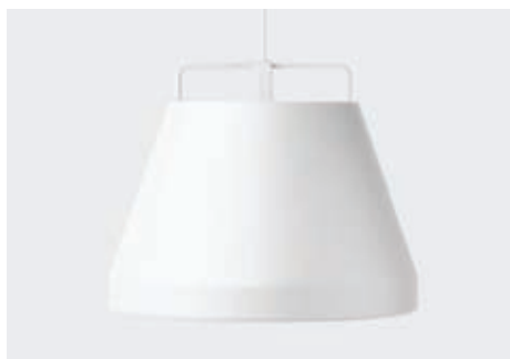
WHITE / WHITE OAK HANGER

— Item No. 80121 LAMP — Spindled Aluminium / White inside HANGER / CORD — Form-pressed Oak Veneer / White Cord