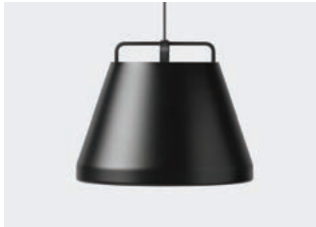
BLACK / BLACK OAK HANGER

— Item No. 80110 LAMP — Spindled Aluminium / White inside HANGER / CORD — Form-pressed Oak Veneer / Black Cord