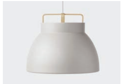
LIGHT GREY / NATURAL OAK HANGER

Item No. 80322 LAMP — Spindled Aluminium / White inside HANGER / CORD — Form-pressed Oak Veneer / Grey Cord