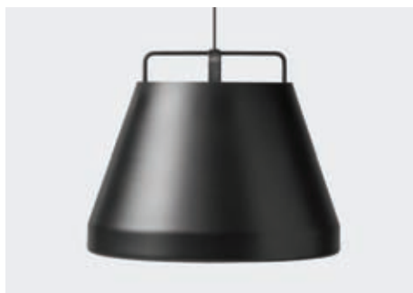
BLACK / BLACK OAK HANGER

— Item No. 80120 LAMP — Spindled Aluminium / White inside HANGER / CORD — Form-pressed Oak Veneer / Black Cord