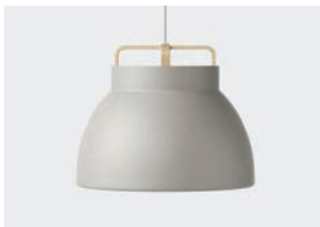
GREY / NATURAL OAK HANGER

LAMP — Spindled Aluminium / White inside HANGER / CORD — Form-pressed Oak Veneer, White Lacquer / White Cord