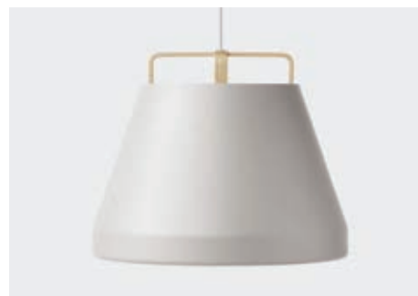
LIGHT GREY / NATURAL OAK HANGER

— Item No. 80122 LAMP — Spindled Aluminium / White inside HANGER / CORD — Form-pressed Oak Veneer / Grey Cord