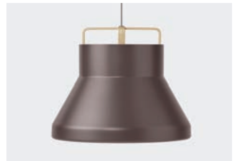
BROWN / NATURAL OAK HANGER

— Item No. 80225 LAMP — Spindled Aluminium / White inside HANGER / CORD — Form-pressed Oak Veneer / Grey Cord