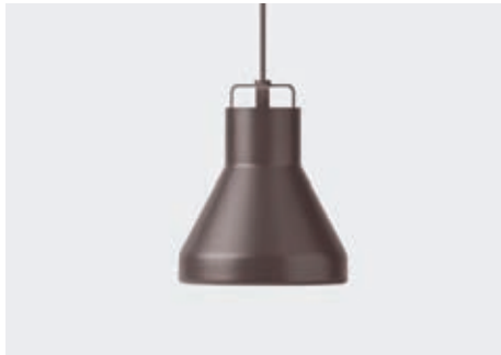
BROWN / BROWN HANGER

— Item No. 80205 LAMP — Spindled Aluminium / White inside HANGER / CORD — Dusty Green Steel hanger / Grey Cord