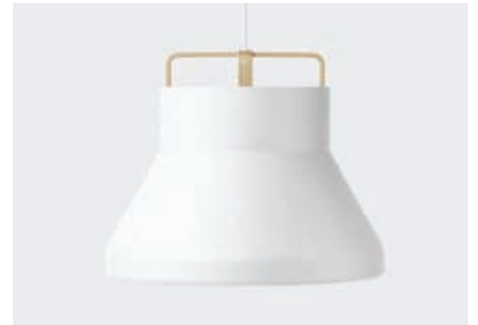
WHITE / NATURAL OAK HANGER

— Item No. 80227 LAMP — Spindled Aluminium / White inside HANGER / CORD — Form-pressed Oak Veneer, Black Lacquer / Black Cord