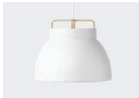
WHITE / NATURAL OAK HANGER

LAMP — Spindled Aluminium / White inside HANGER / CORD — Form-pressed Oak Veneer, Black Lacquer / Black Cord