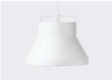
WHITE / WHITE OAK HANGER

— Item No. 80211 LAMP — Spindled Aluminium / White inside HANGER / CORD — Form-pressed Oak Veneer / White Cord