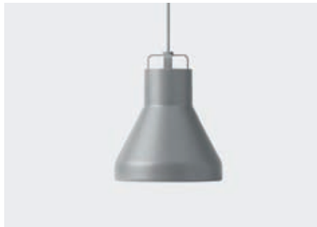
DARK GREY / DARK GREY HANGER

— Item No. 80203 LAMP — Spindled Aluminium / White inside HANGER / CORD — Light Grey Steel hanger / Grey Cord