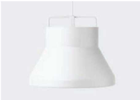
WHITE / WHITE OAK HANGER

— Item No. 80221 LAMP — Spindled Aluminium / White inside HANGER / CORD — Form-pressed Oak Veneer / White Cord