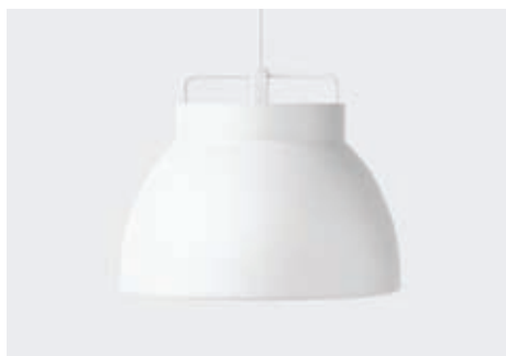
WHITE / WHITE OAK HANGER

LAMP — Spindled Aluminium / White inside HANGER / CORD — Form-pressed Oak Veneer / White Cord