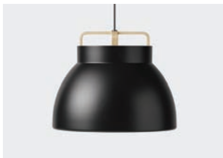
BLACK / NATURAL OAK HANGER