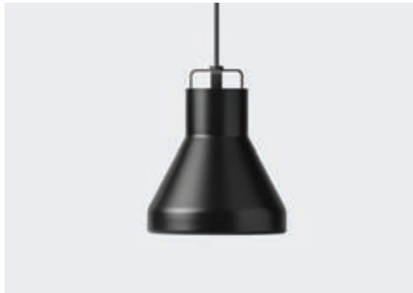
BLACK / BLACK HANGER

— Item No. 80200 LAMP — Spindled Aluminium / White inside HANGER / CORD — Black Steel hanger / Black Cord