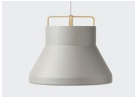
GREY / NATURAL OAK HANGER

— Item No. 80228 LAMP — Spindled Aluminium / White inside HANGER / CORD — Form-pressed Oak Veneer, White Lacquer / White Cord