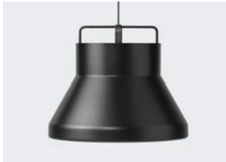
BLACK / BLACK OAK HANGER

— Item No. 80220 LAMP — Spindled Aluminium / White inside HANGER / CORD — Form-pressed Oak Veneer / Black Cord