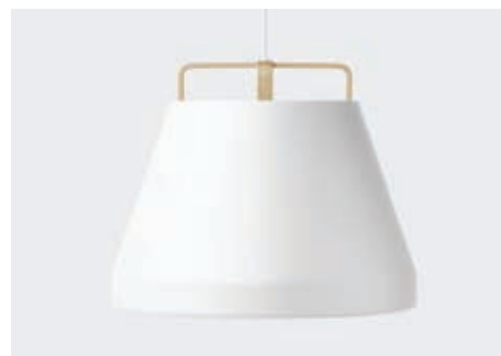
WHITE / NATURAL OAK HANGER

— Item No. 80127 LAMP — Spindled Aluminium / White inside HANGER / CORD — Form-pressed Oak Veneer, Black Lacquer / Black Cord