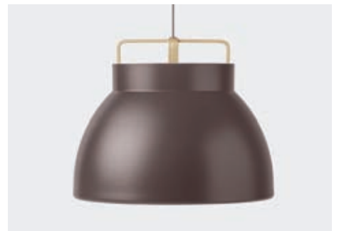
BROWN / NATURAL OAK HANGER

Item No. 80325 LAMP — Spindled Aluminium / White inside HANGER / CORD — Form-pressed Oak Veneer / Grey Cord