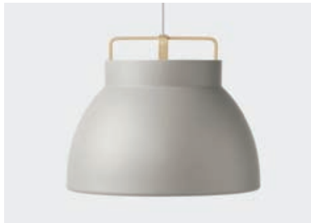
GREY / NATURAL OAK HANGER

Item No. 80328 LAMP — Spindled Aluminium / White inside HANGER / CORD — Form-pressed Oak Veneer, White Lacquer / White Cord