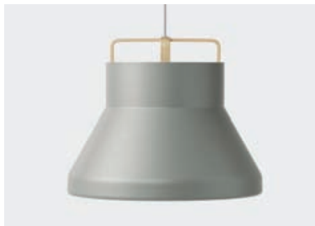
DUSTY GREEN / NATURAL OAK HANGER

— Item No. 80224 LAMP — Spindled Aluminium / White inside HANGER / CORD — Form-pressed Oak Veneer / Grey Cord